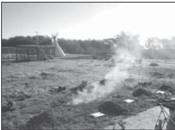
Early morning smoke as the hearths are ignited and Potter member hot-rock experiment begins.

A series of experiments were undertaken at Lubbock Lake during the fall. The experiments were designed to examine whether some of the rocks that were recorded during 2005 field season had been fractured due to intense heating. If they had, then it would be important as it would prove that they once had been used as components, useful for example in cooking foods, within prehistoric hearths. The experiments were a success and the results indicated that not only did the rocks break up much like those seen on the ranch, but also a red rind was produced by the heating. This characteristic, then, will be very useful in identifying which rocks were used by ancient peoples during fieldwork