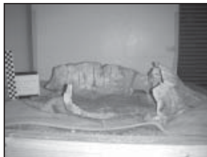
Extinct giant tortoise after excavation from the plaster jacket.

Immersion of the larger specimens in a 0.5% PVAC solution took place outside in a very large basin using custom-made baskets. A safety protocol was followed, including a fit test and fitted masks for the people doing the immersions. After treatment, the material was cleaned, cataloged, and labeled. Currently, over 1600 specimens have been treated and processed so far, with around 5800 left to be treated.