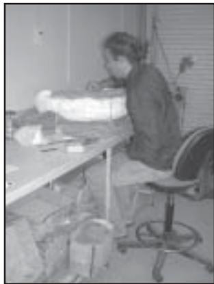
Plaster jacket containing the extinct giant tortoise Geochelone being excavated from the bottom up.

Another new research area within the Landmark's regional research program is the Turtle Creek drainage area on the Roland Springs Ranch east of Snyder. RSR Locality 1 is a paleontological locality that may date to the middle Pleistocene, a rare occurrence in Texas. During the fall and winter months, stabilizing and processing began of the material recovered during test excavation in July 2005. Over 7,000 specimens were recovered representing nearly 30 different animals. The most impressive was the near complete tortoise shell that