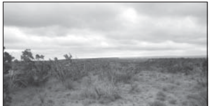
One of the rim sites at the edge of the caprock looking east over the Rolling Plains near Post. See story on page 3.